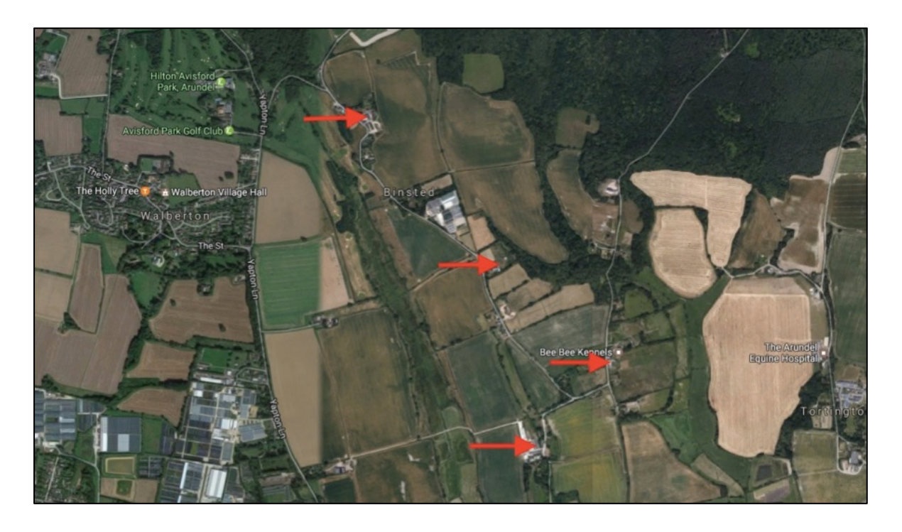
Figure 3: The location of Barn Owl boxes / nesting sites around the parish of Binsted