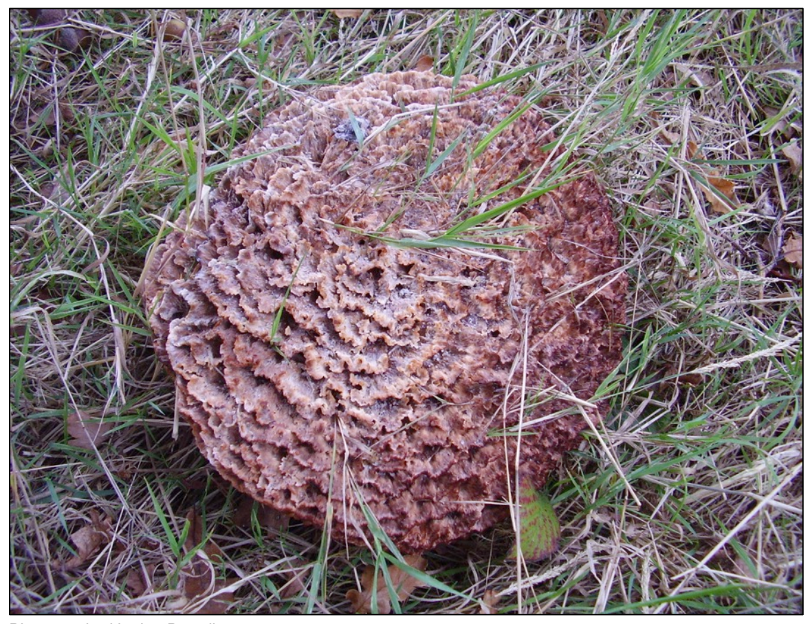
Photograph 1: The Zoned Rosette Podoscypha multizonata

Within this list the Tiered Tooth is most likely to be Hericium cirrhatum , which is uncommon with a limited distribution and on the Sussex Rare Species Inventory. The Zoned Rosette Podoscypha multizonata (Photograph 1) is a Section 41 species (NERC 2006), a BAP species and also on the Sussex Rare Species Inventory. Mycena flavescens is another uncommon species.