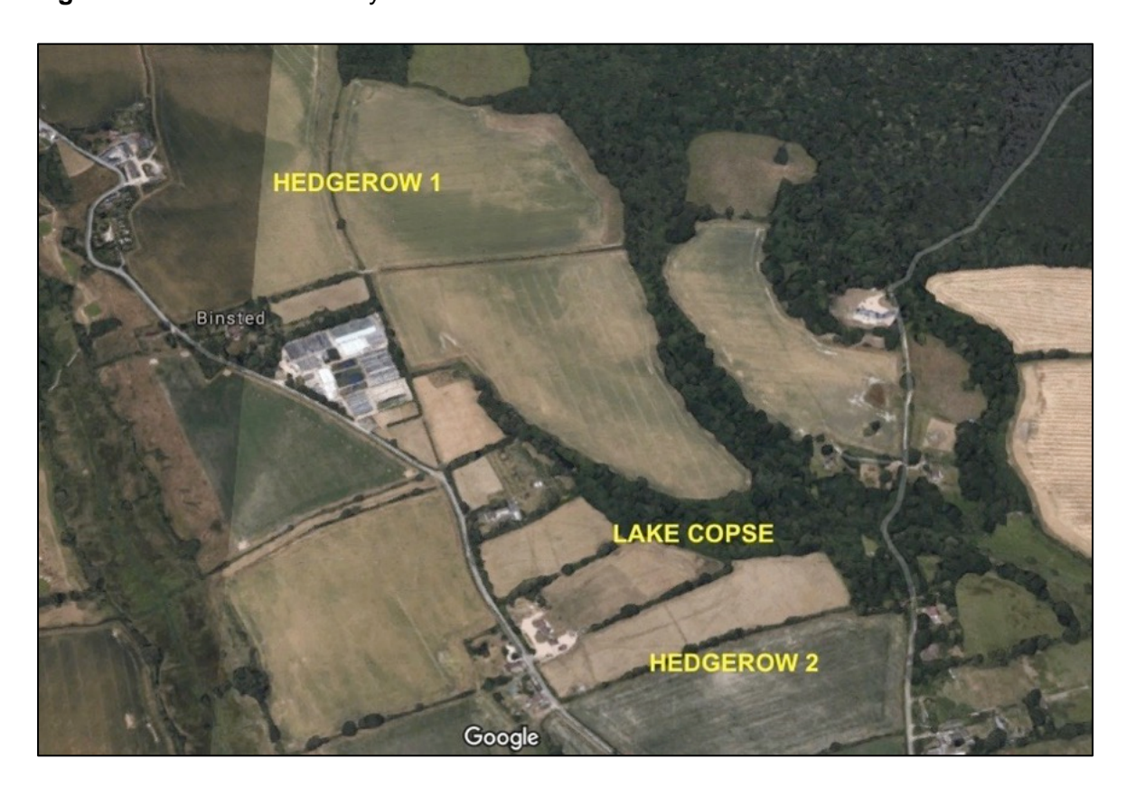
Figure 7: Three areas surveyed for beetles

The survey found 230 beetle species, including one Red Data Book species and eleven Nationally Scarce species (shown in Table 4). Moreover, each location also produced a beetle not previously recorded in Sussex.