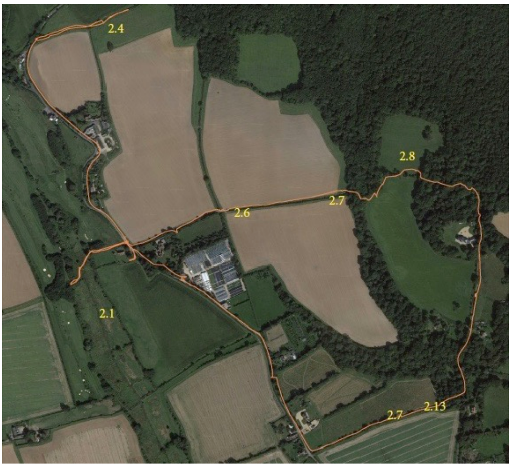
Figure 8: Route taken around Binsted parish for invertebrate survey

Image from 'An Entomological survey within Binsted Parish' (Edwards 2016)