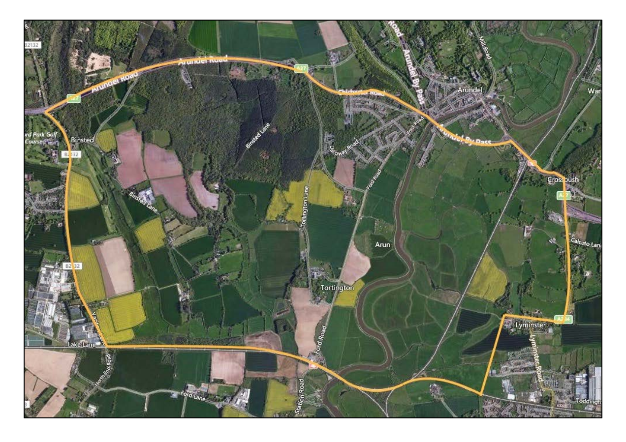
Figure 1: The Mid Arun Valley

This report was commissioned by MAVES (Mid Arun Valley Environmental Survey) as a significant amount of data has been collated since the publication of the 2016 survey. MAVES is a community based not-for-profit charity.