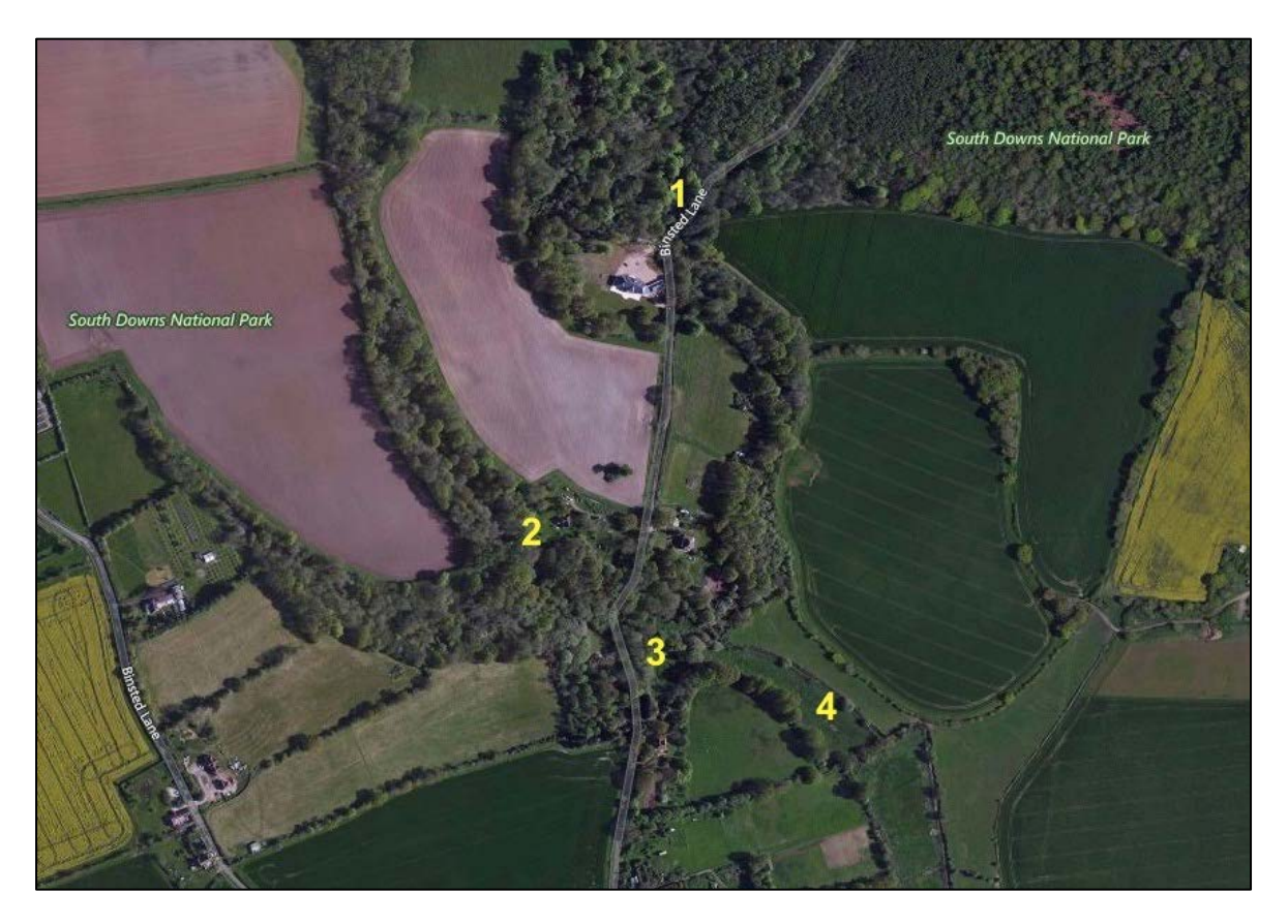
Figure 4: Common Toad breeding sites around the parish of Binsted