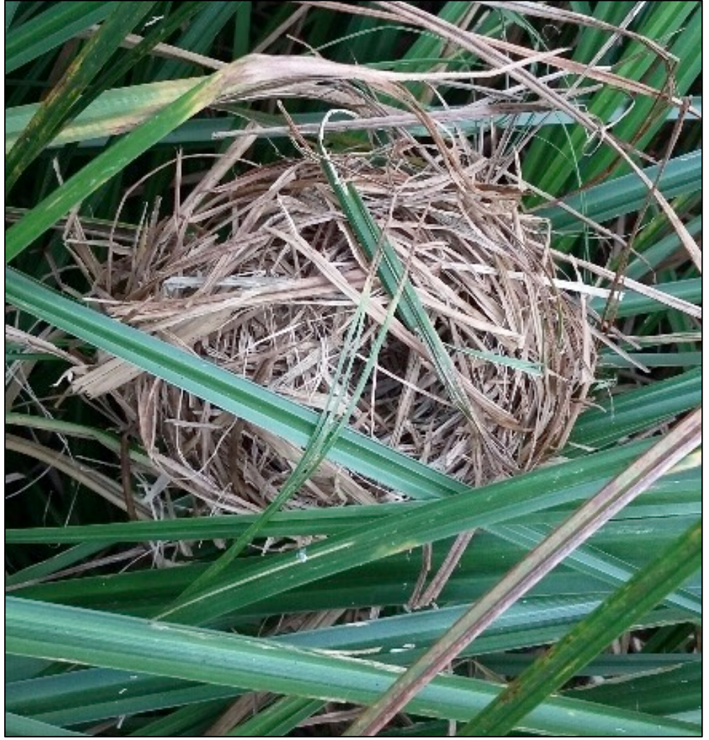
Photograph 5: One of the Harvest Mouse nests found