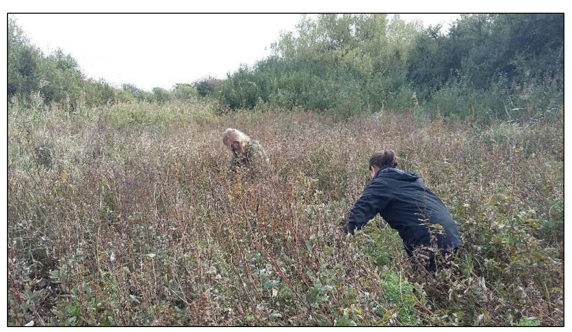
Photograph 4: Surveying for Harvest Mice nests in a Binsted field